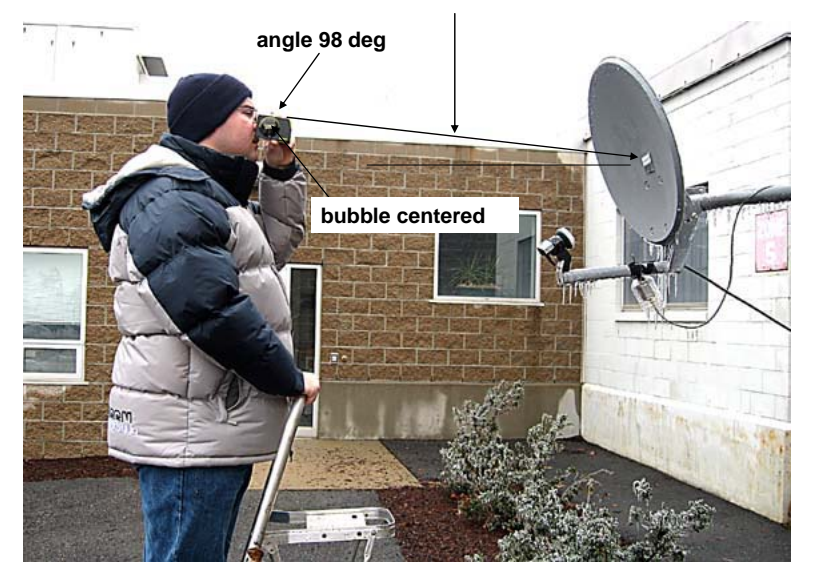
Observe the reflection of the feed in the mirror in the center of the dish