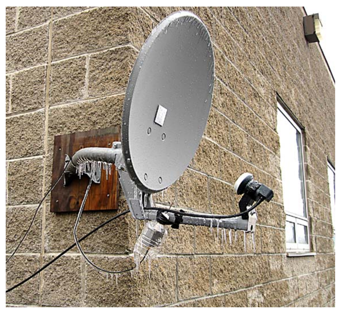
Figure 2. When correctly assembled the LNBF should be 13" (\pm 0.25") from a point 9" up from the bottom edge of the reflector. The LNBF should point towards a point 9" from the bottom of the reflector rather than right at the center. The bottom edge of the front LNBF should be 10" (\pm 0.25") from the bottom of the reflector.