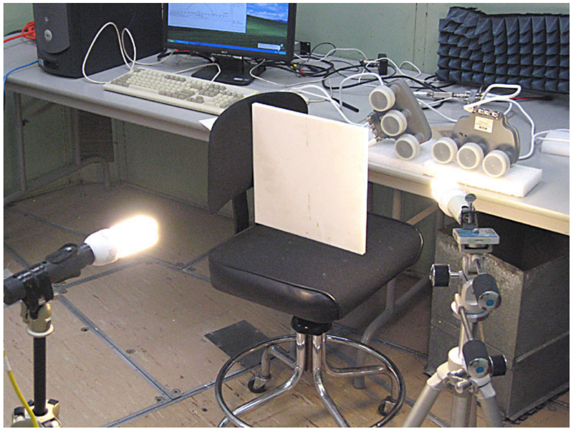
Figure 2. Single baseline interferometer show with dielectric slab in path to one LNBF.