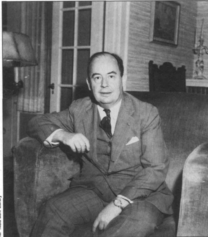
John von Neumann – ' . . . infamous postulate: the measurement act 'collapses' the state into one in which there are no interference terms between different states of the measurement apparatus . . .'

(iii) von Neumann is concerned here with what happens to the state of the system that has suffered the measurement – an external intervention. In application to the extended system S' (= S + A) von Neumann's collapse would not occur before external intervention from R' . It would be surprising if this consequence of external intervention on S' could be inferred from the purely internal Schrödinger equation for S' . Now KG's collapse, although justified by reference to 'all known observables' at the S'/R' interface, occurs after 'measurement' by A on S , but before interaction across S'/R' . Thus the collapse which KG discusses is not that which von Neumann infamously postulates. It is