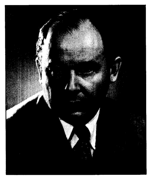
John von Neumann

tain spatial position. The next decisions are the position of the first collision and the nature of that collision. If it is determined that a fission occurs, the number of emerging neutrons must be decided upon, and each of these neutrons is eventually followed in the same fashion as the first. If the collision is decreed to be a scattering, appropriate statistics are invoked to determine the new momentum of the neu-