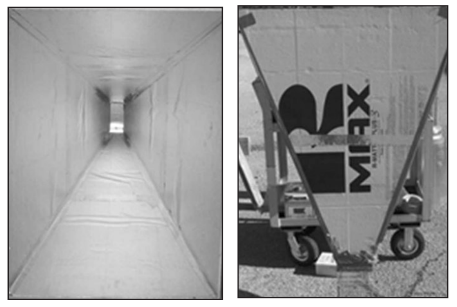
Figures 3 & 4. Inside of foam/aluminum horn with taped seams. Outside of low-cost horn antenna.