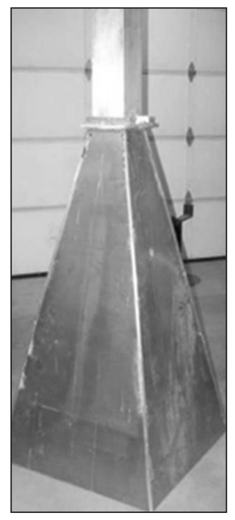
Figure 5. CP horn antenna using all-aluminum construction.

The prime focus dish is well understood. With advancements in feedhorn designs, efficiencies up to 67% are possible with antenna temperatures (Ta) in the range of 30°K as calculated and measured on a 20 \lambda diameter dish.<sup>1</sup> With a dish diameter of 10\lambda (about 2.4 m on the 23cm band), gain is approximately 28 dBi. At a diameter of 1 m, the dish offers about 20 dBi of gain, which is the planned target. As the dish's diameter is reduced, though, Ta will rise due to a higher percentage of feedhorn blockages. Building and mounting the dish is where the labor and cost come into play. Despite the added mechanical construction, if a small used dish is available. then the dish is the value winner.